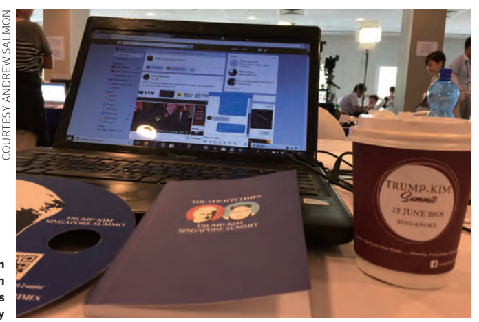
Ready for action in the press center - with branded summit goodies on full display

Yay! I was in! At Incheon airport in Korea, waiting for the flight to Manila, I discovered